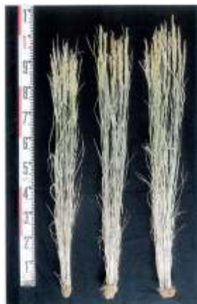
Image of Plant Variety