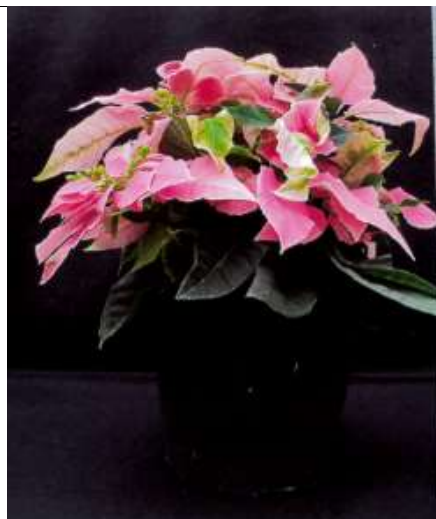
Image of Plant Variety