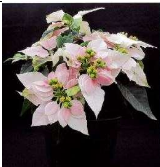
Image of Plant Variety