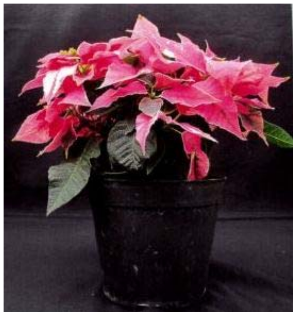
Image of Plant Variety