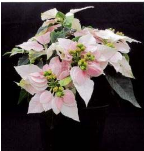
Image of Plant Variety