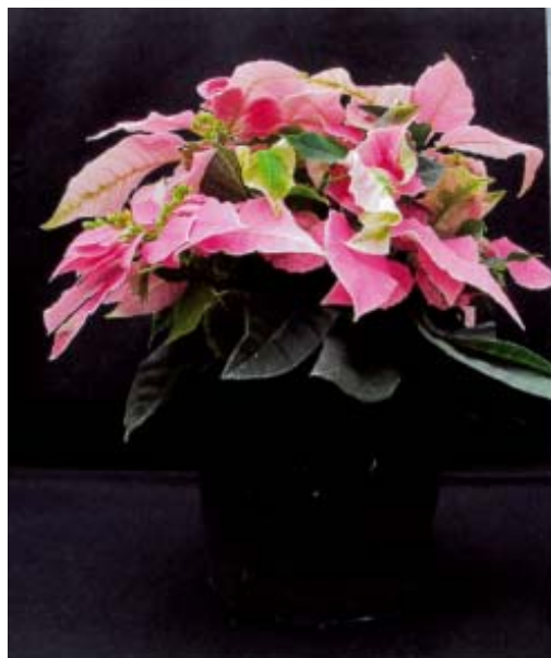
Image of Plant Variety