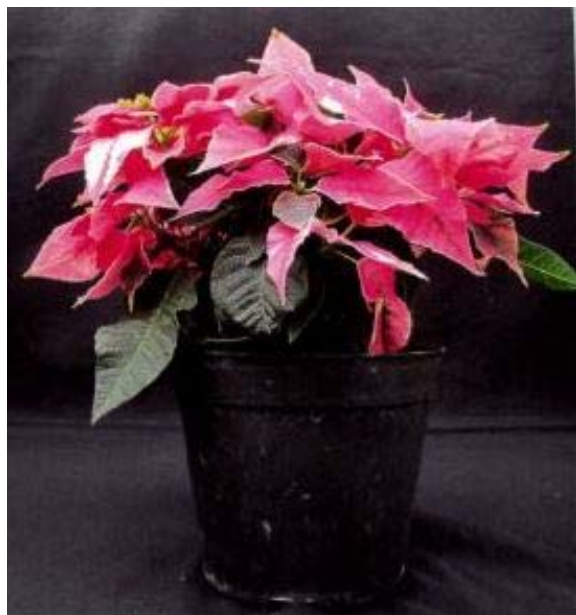
Image of Plant Variety