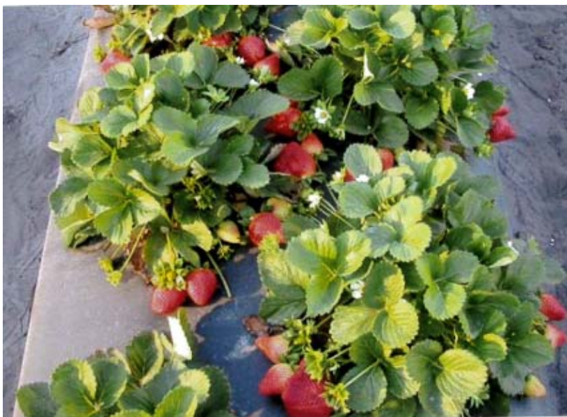
Image of Plant Variety