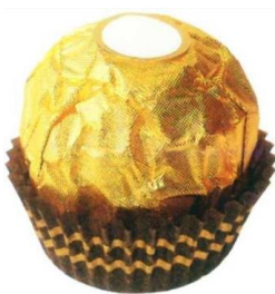
(the “ Application Mark ”)

in Singapore on 23 December 2013 under International Registration No. 1199758 (Singapore Trade Mark No. T1406403E).