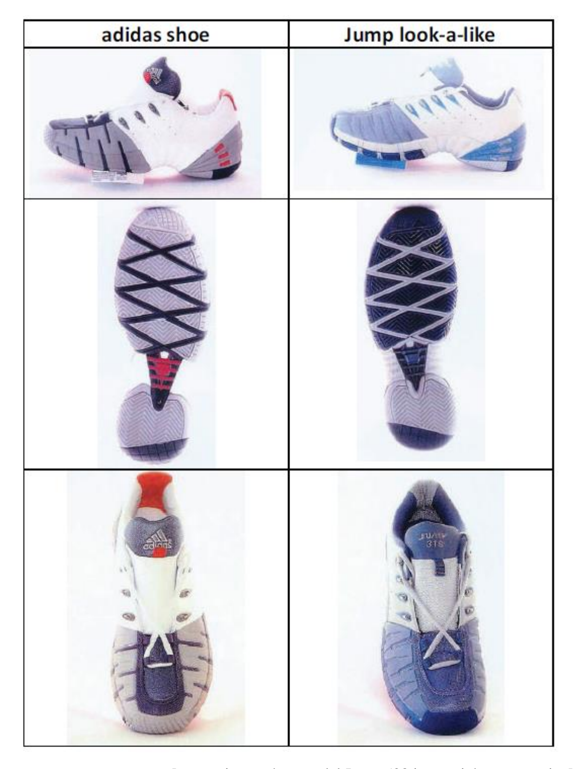
[annotation at shoe model Jump 508 in top right corner mine]

At the hearing, in seeking to correctly interpret the evidence, I referred to the above exhibit and observed that none of the pairs of shoes above (compared in rows) compare the use of the Application Mark versus the Opponent's Mark. Indeed, the Application Mark can only (barely) be discerned in shoe model Jump 508. The Opponent's counsel responded that the point of the exhibit is the similarity in shoe designs, because [36] of Talbot-1 is organised under the section of evidence on bad faith. She pointed out that, comparing the shoe designs, there is close similarity, not necessarily in the use of the respective marks but in the way that the shoes are designed.