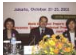
Sharing experiences in Indonesia.

Intellectual Property Offices Conference at the Carlton Hotel. IPOS also participated in the 125th International Trademark Attorneys Association annual conference, held in Amsterdam, Netherlands, from 3 to 7 May 2003.