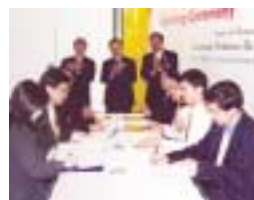
Sealing deals at GFL2003.

The work of our Committee on International Classification of Goods and Services (ICGS) was also endorsed by WIPO through its selection of the Singapore Office as its representative to train the Directorate General of IP Rights, Indonesia, on ICGS matters during the National Workshop on the Classification of Trademarks for Goods and Services held in Jakarta from 12 to 16 January 2004.