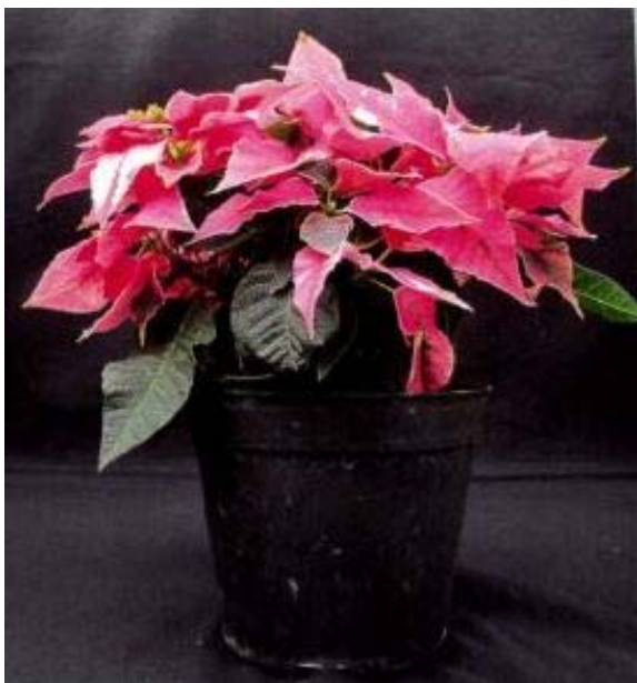
Image of Plant Variety