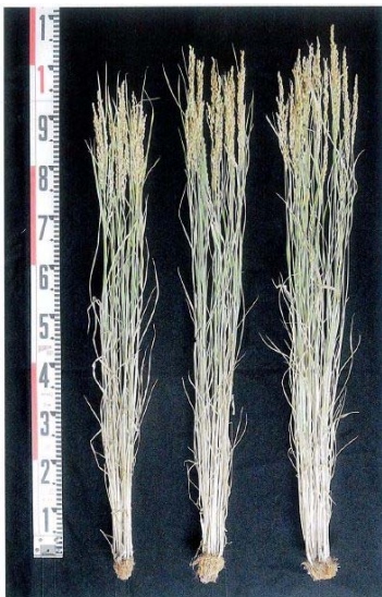
Image of Plant Variety